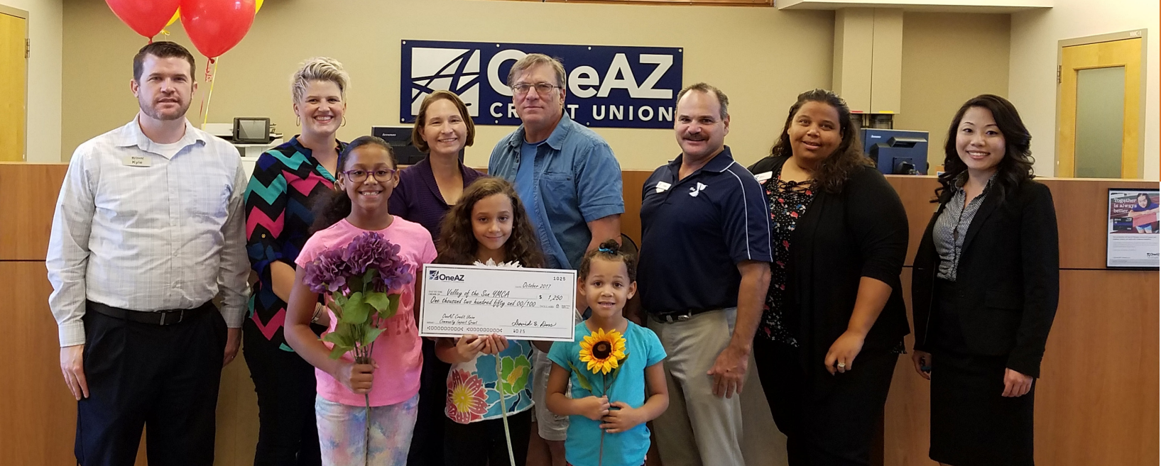
Representatives of Valley of the Sun YMCA receive their check from Glendale – ASU West branch associates.