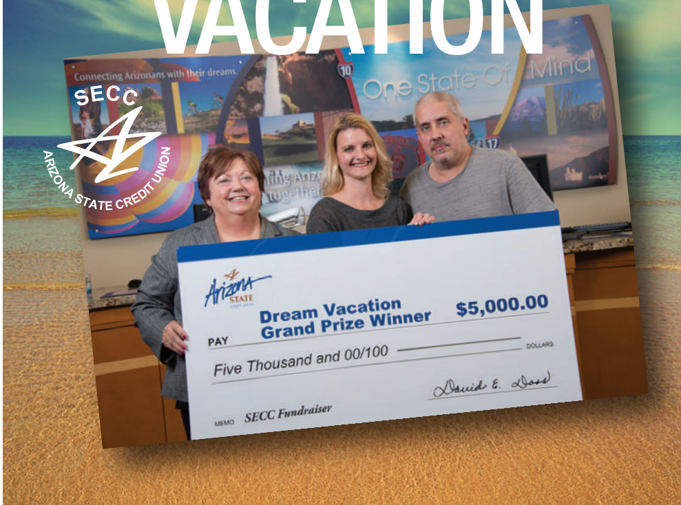
SECC grand prize winners